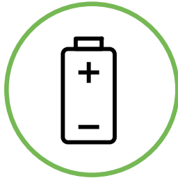
Alkaline & carbon