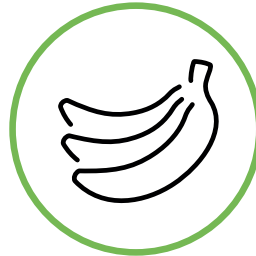
Fruit & veg peels