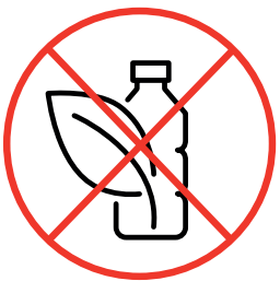
Biodegradables & compostables